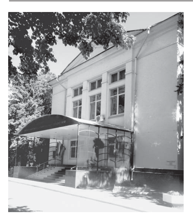
Fig. 2. Central Research Institute of Tuberculosis (2 Yauzskaya Alleya). This building housed the Institute of Functional Diagnostics and Therapy.

was short-lived: in the early 1930s, the study of genetics displaced Zelenin, repurposing this scientific institution into the Medical Genetics Institute, and in the second half of the 1930s, its director S. G. Levit was arrested and then shot. The institute was closed and its related archival materials were probably destroyed. [2, p. 64-68]