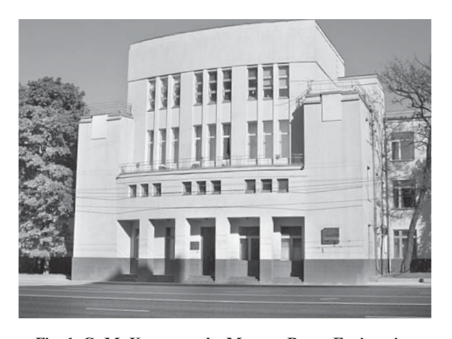
Fig. 1. G. M. Krzyzanovsky Moscow Power Engineering Institute (19 Leninsky Prospekt). The building was constructed for the Biomedical Institute at the Directorate of Scientific, Artistic and Museum Institutions for the Russian Soviet Federated Socialist Republic.

Initially, the new institute was not located under its own roof and was located with the Novo-Ekaterininskaya Hospital, on the corner of Petrovka Street and Strastnoi Boulevard. Zelenin succeed in having funds allocated to build a new, separate building on Leninsky Prospekt (Building No. 19), "a special project in the spirit of modern constructivism" (the building now houses the G. M. Krzhizhanovsky Energy Research Institute, Fig. 1). The first national institute of therapy