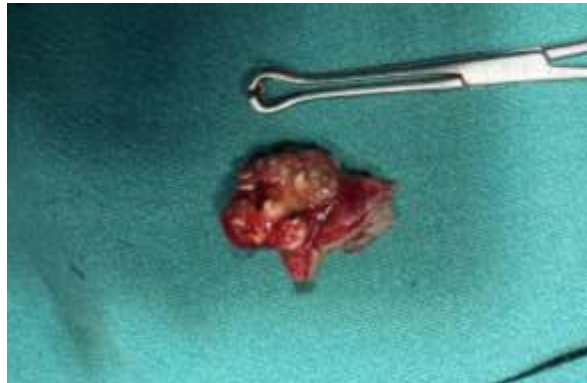
Fig 2. Postoperative macroscopic appearance of the totally excised firm chalky white nodule showing a lobulated appearance