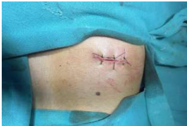
Fig 3. Postoperative macroscopic appearance of right side of patient's back after total excision